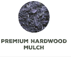
PREMIUM HARDWOOD MULCH